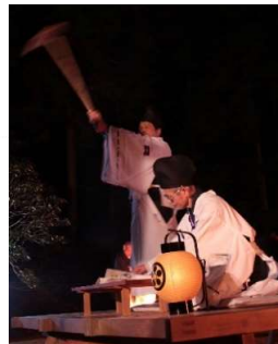
⑤Hirao Mikumari Shrine and Its 'Onda Matsuri' Festival

The 'Torii' gate really stands out against the surrounding rice fields. The main shrine building is a cultural property designated by Nara Prefecture. This shrine is known for its traditional festival 'Onda Matsuri', which is annually held here on January 18th to pray for a good harvest.