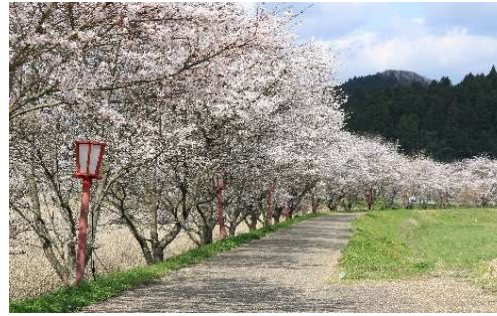
④Cherry Blossoms along Uda River