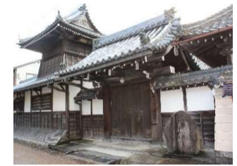
⑧ Mampo-ji Temple