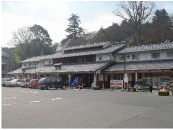
⑫ Roadside Station Uda and Its Foot Bath