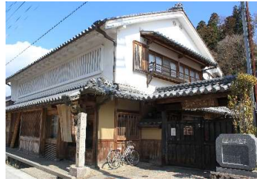
⑩ Morino Medicinal Herb Garden and 'Katakuri'