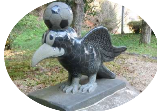
Yatagarasu (Legendary 3-Legged Crow)

This shrine is associated with the first emperor of Japan, Jimmu. Its enshrined deity, Yatagarasu (a legendary three-legged crow) is believed to have been sent from heaven as a guide for the Emperor Jimmu on his journey.